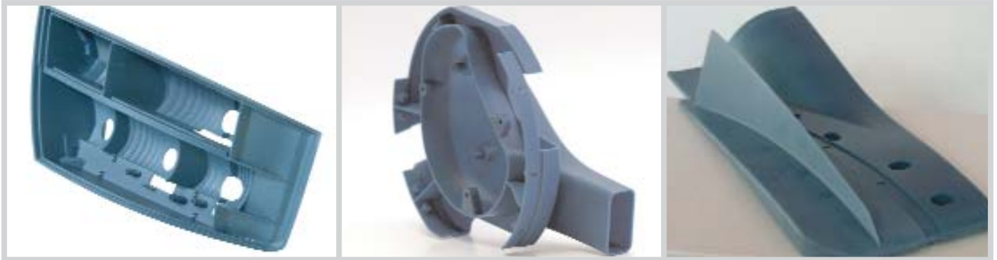
Aerodynamic and functional parts produced with Bluestone nano-composite plastic. Images (center and at right) courtesy of Renault F1 Team.

A high stiffness engineered nanocomposite that opens new applications for stereolithography users.